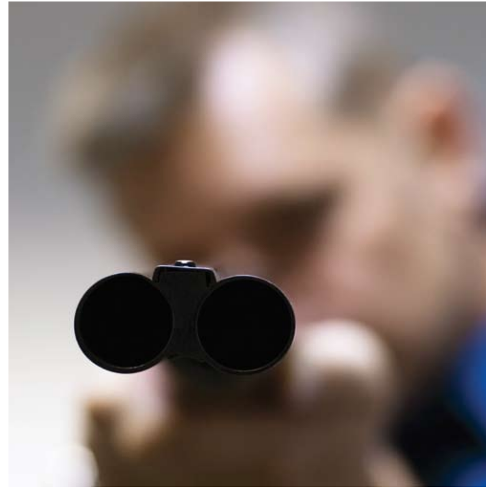
>> This is a weapon specifically designed to intimidate.

Tension levels nearly reached the breaking point when the man fired his weapon over the guardrail and then passed the barrel in front of the officers' location. Despite the growing danger, ERT members maintained their composure and managed to get a cell phone to the man, who eventually agreed to surrender. The officers involved,