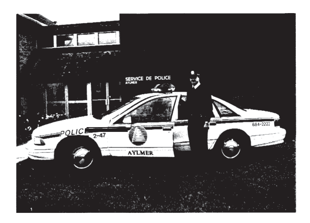
Photograph 1 - Gore-Tex lined sweater