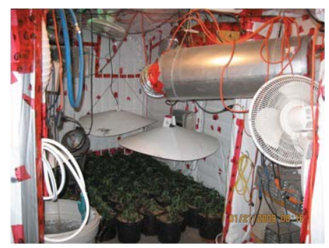
Typical electrical concerns associated with grow operations.

The importance of these two approaches was that they placed the problem of marijuana grow operations within the context of public safety, rather than considering this issue exclusively as a criminal justice matter.