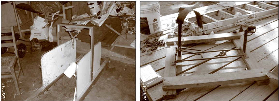
Above: a “Treadmill” and a “Rape Stand.”

Barrels: Barrels or drums of plastic, or occasionally metal, are often used as shelter for fighting dogs. Placed horizontally, a hole is cut out from one side for the dog to enter and exit. Such housing might not meet state or local standards for required shelter if it does not provide adequate protection from the elements.