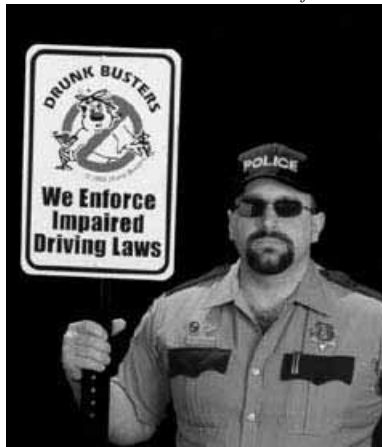
Drunk Busters of America

Although police want to create the impression that all drunk drivers will be arrested, in reality only a small percentage of drunk drivers on the road at any particular time will in fact be stopped or arrested.