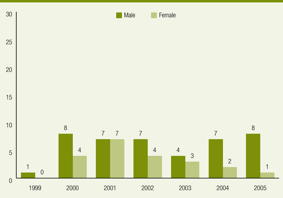
Figure 3: Number from the 1991 New South Wales cohort leaving each year, 1999–2005 (percent)