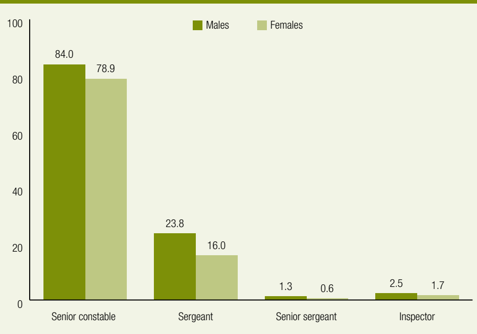
Figure 2: Rank attainment at 31 December 2005, by sex (percent members of cohort)