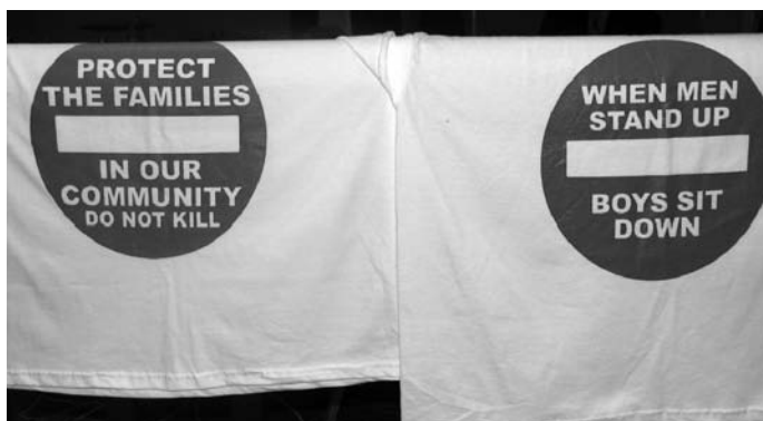
Source: Police Executive Research Forum, Executive Session, March 2008.