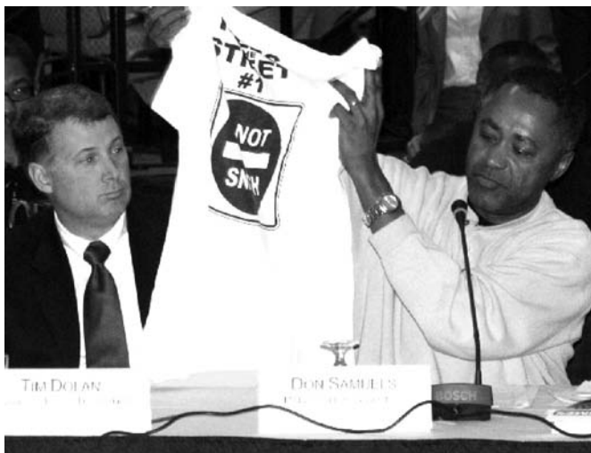
Source: Police Executive Research Forum, Executive Session, March 2008.