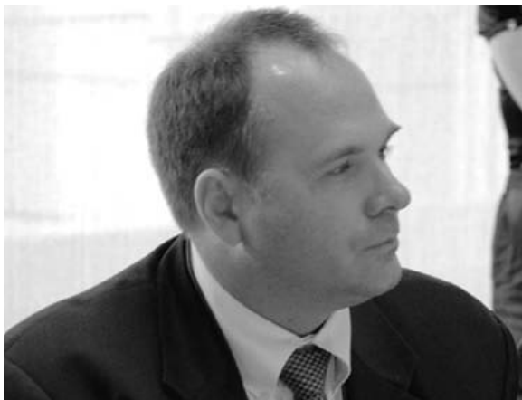
U.S. Capitol Police Chief Phillip Morse

For example, our original plan was that 1.8 million people would fit on the lawn of the National Mall, but the reality was that overflow blocked egress and access on streets around the Mall. So when you are executing a plan but it changes, who is going to get the information about those changes down to the officers in real time? It can be difficult,