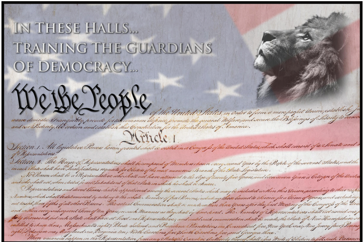
Figure 2. A 6' x 9' Mural of the United States Constitution