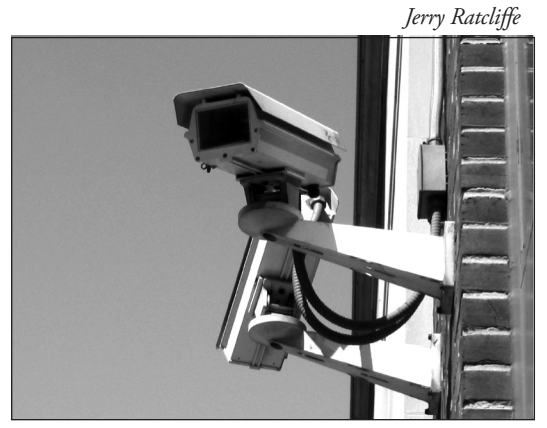
With an overt CCTV camera, the public (and offenders) can clearly see the surveillance camera and determine the direction in which it is facing.

Although most CCTV schemes employ overt cameras, which are obvious, it is possible to find systems in which cameras are mounted into protective shells or within frosted (polycarbonate) domes. Often termed semi-covert, these camera systems make it more difficult for people under surveillance to determine if they are being watched, as it is usually impossible to figure out in which direction the camera is facing. Some cameras employ dummy lenses to conceal the surveillance target. The advantage of using a one-way transparent casing is that it provides for the possibility of retaining the overt impression of surveillance—and hence a deterrent capacity—without having to place a camera in every housing or to reveal to the public (and offenders) the exact location under surveillance.<sup>3</sup>