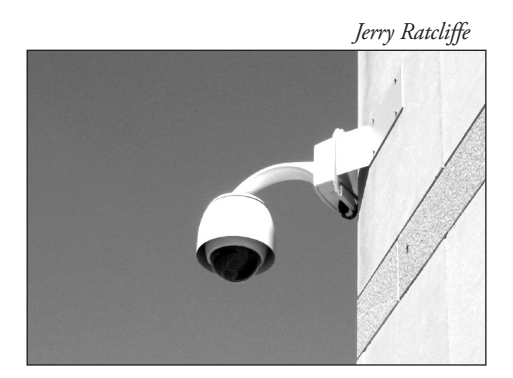
This semi-covert CCTV camera may have a crime prevention advantage over an overt system because offenders can never be sure in which direction that camera is facing.

In summary, there is a range of CCTV configurations available. A complete CCTV system (for the purposes of this report) comprises: