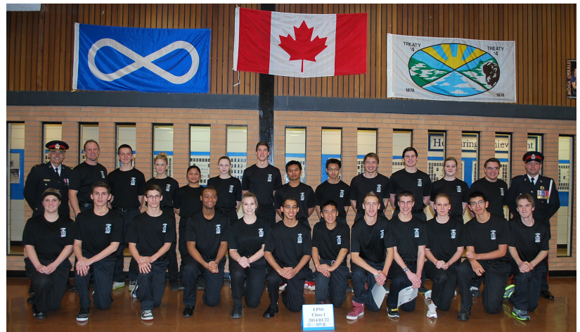
Class #1, Law, Public Safety and Security Program Campus Regina Public