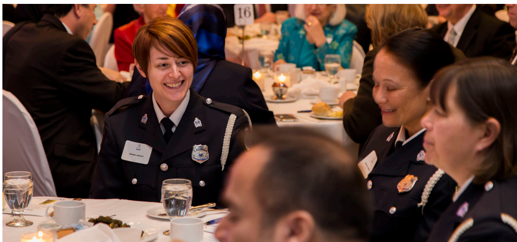
Intercultural Dialogue Institute Regina Friendship Dinner