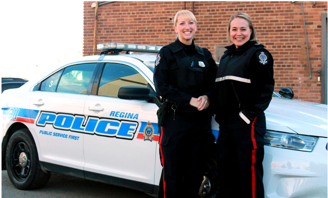
Community Services Division