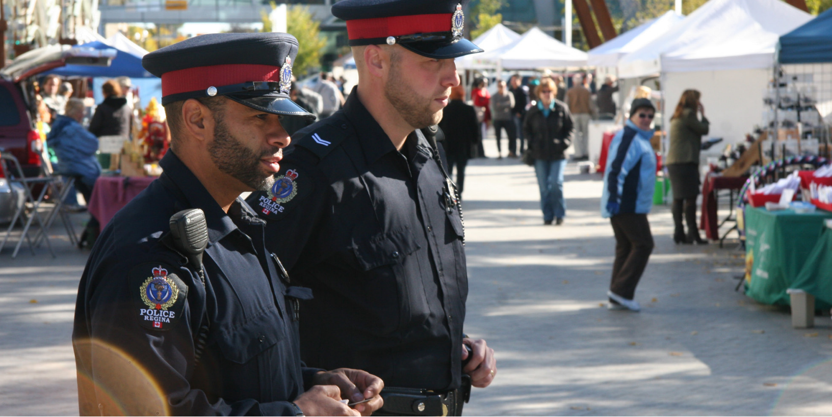
Beat Officers at the Farmers' Market