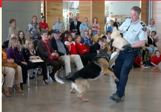
Police service dog demonstration at RCMP Heritage Centre