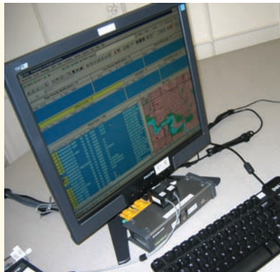
DOCC work station