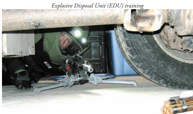
Explosive Disposal Unit (EDU) training

The mandate of the DOCAS Unit is to educate RCMP members on drugs and gangs. DOCAS will then collaborate with personnel at the Detachments and residents to encourage them to participate in the reduction of gang activity. By working with our communities, we will have strategies in place to reduce violence and crime as many of the issues and incidents are gang-related.