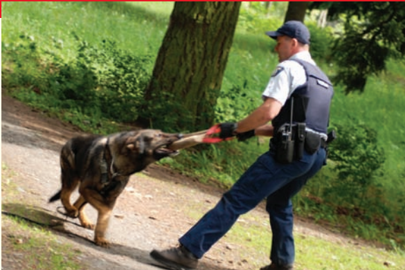
Dog master with his partner - training