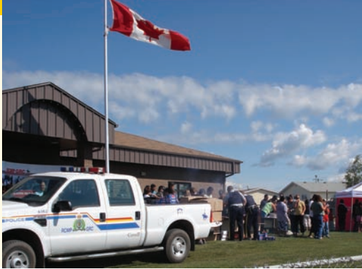
RCMP LaLoche Detachment Open House