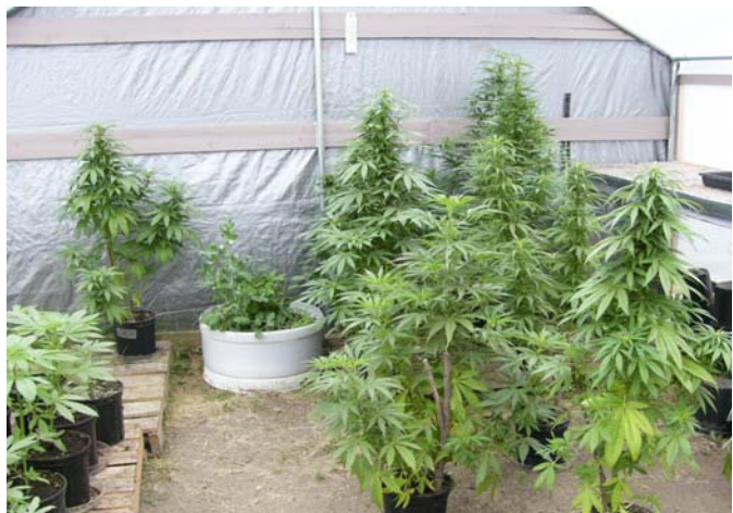
Seizure of drugs