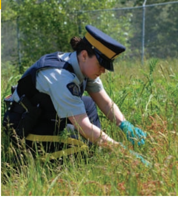
Crime Scene Investigation