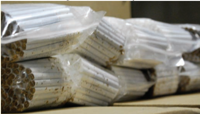
Cigarettes, contraband, counterfeit

The Integrated Child Exploitation Unit (ICE) became operational as of October 2008. The catalyst behind the creation of ICE was due to the increasing number of files involving child pornography, child exploitation, and luring over the internet. The borderless nature of the internet has forced Saskatchewan to follow the direction of other provinces in the creation of a provincial investigative unit mandated to pursue those who abuse children via the internet. The purpose of the Integrated ICE unit is to bring about a sustained targeted enforcement on these types of investigations throughout the province. The Government of Saskatchewan through the Ministry of Corrections, Public Safety and Policing is funding eleven Internet Child Exploitation resources dedicated to the investigation of child exploitation offenses. These resources are comprised of personnel from the Regina, Prince Albert and Saskatoon Police Services, as well as the RCMP. In the first quarter of 2009, ICE responded to 26 Internet-related investigations involving abused children.