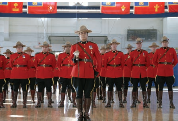
RCMP “F” Division Change of Command Ceremony November 2008

All our performance management efforts from the Balanced Score Card through to the Annual Performance Plans have provided the RCMP a much clearer strategic focus. This means we are always evaluating what we do and how we do it in order to meet the priorities of the communities we serve. As we move forward, we expect this foundation to allow us to be even more effective in reducing crime and making a better, safer life in Saskatchewan.