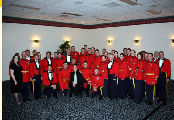
RCMP Charity Ball