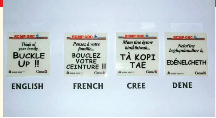
Traffic Services Road Safety Vision