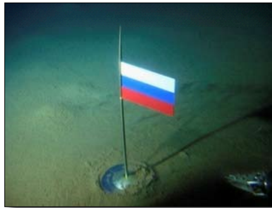
Russian Flag on the Arctic Sea Bed

Within existing frameworks of international law, the concept of sovereignty is rooted in the manifestation of territorial control and jurisdictional authority. Sovereignty is increasingly associated with a responsibility toward the safeguard of citizens, and as such, increased expectations are placed on Canada not only to show a strong presence in the Arctic waters, but also to enact and enforce laws and regulations that govern the country.