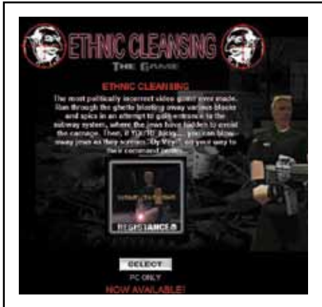
A Screenshot from the racist game "Ethnic Cleansing" where players try to kill "subhumans."

Violent and controversial videogames are nothing new. However, for many games bought in stores, there are ratings to denote content is inappropriate for young children and stores restrict who can purchase them to adults. However, what is shared, distributed, and played online can be a different story.