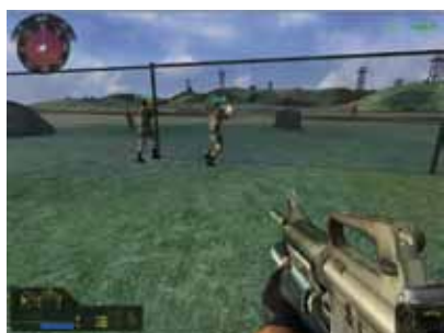
Screenshots from Hezbollah's Special Force 2 game in which players re-enact the attacks against Israel.