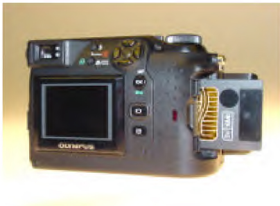
Rear view of camera with the Smart Media card used for memory storage. With the camera set at high quality, the user will get 20 pictures per card.

The Olympus C-3030 is the upgraded version of the previous C-2020 Zoom model. The C-3030 is in the semi-professional category of digital cameras that can be operated in Manual, Semi-automatic or Automatic mode. In addition, the C-3030 has many features, including: 3x optical zoom, optical view finder (for use outside of the housing) LCD viewing screen, video out, serial out, direct printing to Olympus 300 series printers, SmartMedia memory, burst recording mode, self timer, Macro and Panorama mode. Other semi-professional features include matrix (averaging) and spot metering, exposure compensation, white balance control (Auto, Daylight, Overcast, Tungsten light and Fluorescent light), and multiple ISO settings (Auto, 100, 200, and 400). The C-3030 enables the user to use spot metering to isolate a subject and ensure proper exposure.