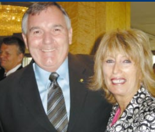
Representatives of Securiguard and Electronic Arts Inc., Sponsors for the 2004 CACP Conference.