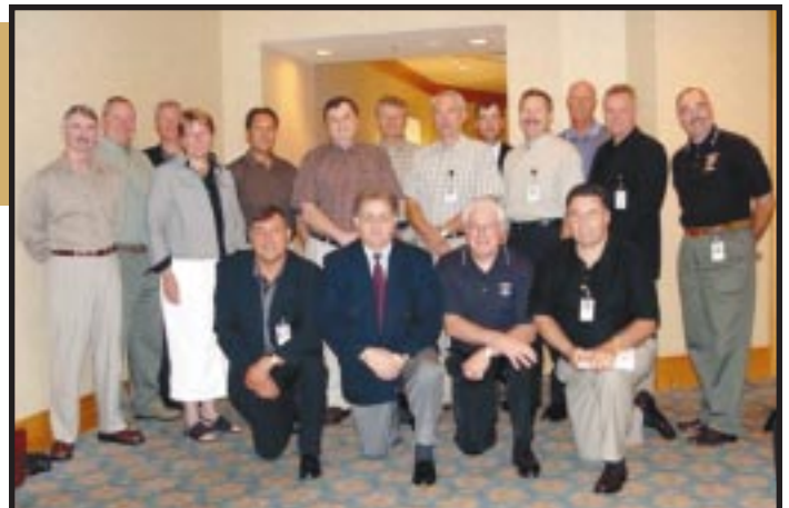
2003-04 Outgoing CACP Board of Directors