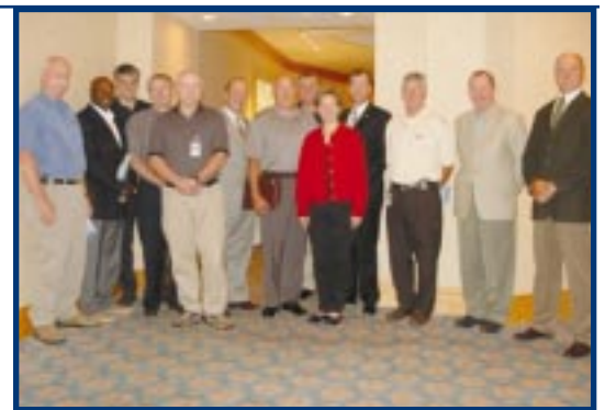
2004-05 CACP Committee Chairs

Are you interested in working with your peers on initiatives that are important to policing in Canada? CACP Committees are looking for members who want to participate in activities that support the CACP's efforts to lead progressive change in policing. Become involved today! See www.cacp.ca for a complete list of Committees and their mandates.