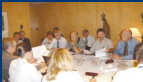
The CACP Drug Abuse Committee at work