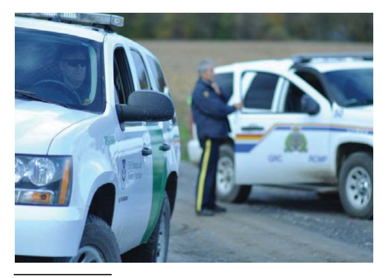
3 The predominant increase is among criminal entrepreneurs.

The predominant illegal activity favoured by these groups is drug smuggling and trafficking . Illicit drug movement trends worldwide influence the evolving threat at Canadian borders. For example, the expanding heroin trade in Afghanistan is expected to increase smuggling activity at Canada's border. The supporting evidence is the growing number of heroin shipments originating in Afghanistan that are being seized en route to Canada. In addition, in the last two years, an increasing number of cocaine shipments en route from Canada to Australia have been seized in both countries. As cocaine consumption continues to rise in Asia, the threat of outbound cargo or passenger mule cocaine shipments is expected to grow.